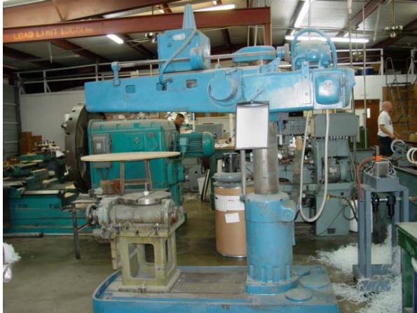
Cincinnati Radial Drill 3 ft x 7 1/2" SN 1L31A5D-54 with Pratt & Whitney 1828-16 Rotary table SN 0720